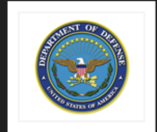
United States Department of Defense (DoD)